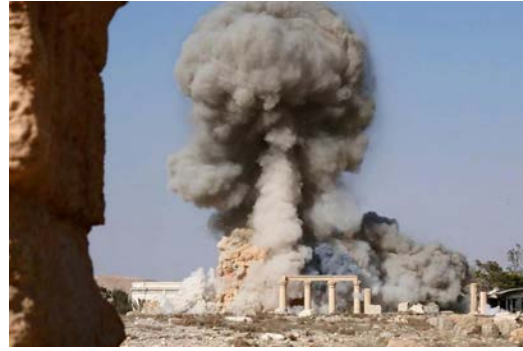
Figure 14: Destruction of the Baalshamin Temple (ISIL social media; August 24, 2015)

On August 23, 2015 reports surfaced concerning the destruction of the Baalshamin Temple. 26 Baalshamin was the Lord of the Heavens in the pre-Islamic Semitic pantheon. According to Ross Burns, the earliest architectural remains date to 17 CE, though the majority of the structure dates to the early 2nd century CE. The Egyptian motifs that characterize the style of the small temple make it unique in Roman Syria. 27 Following the destruction, photographs released by ISIL depicted the inner and outer walls of the temple lined with bottles and barrels of explosives, which were subsequently detonated. 28 DigitalGlobe satellite imagery taken on August 27, 2015 acquired by ASOR CHI has confirmed this destruction (Figure 15).