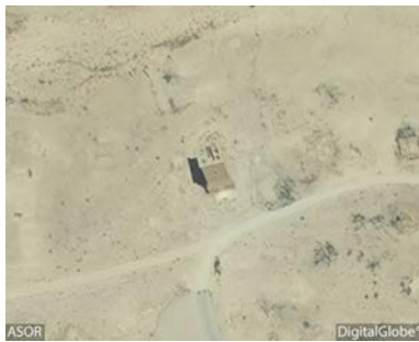
No visible damage (DigitalGlobe; June 26, 2015)