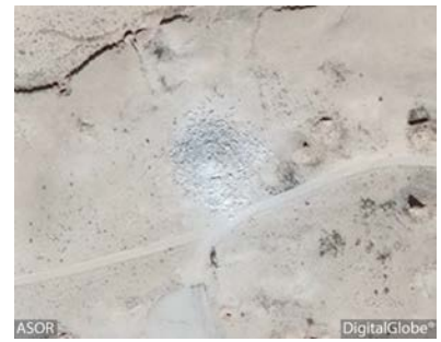
Visible damage (September 2, 2015)