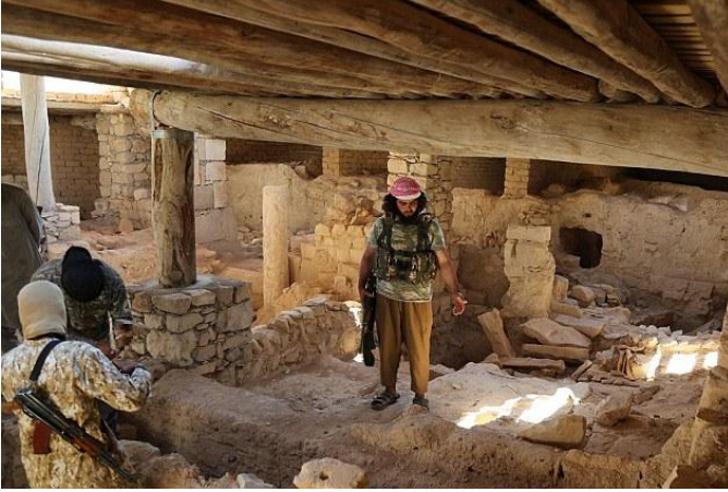
Figure 12: Mar Elian being prepared for destruction

In late July 2015, ISIL militants took control of al-Qaryatain, a neighboring village of Palmyra, from the Syrian government. On August 7, 2015, militants abducted hundreds of local Christians from the village and demolished its ancient monastery of Mar Elian (Figure 12), which was constructed during the Byzantine period and continued to be used as a Christian place of worship in the area. 23 DigitalGlobe satellite imagery of this site corresponding to the time of destruction was not available at the time of this report.