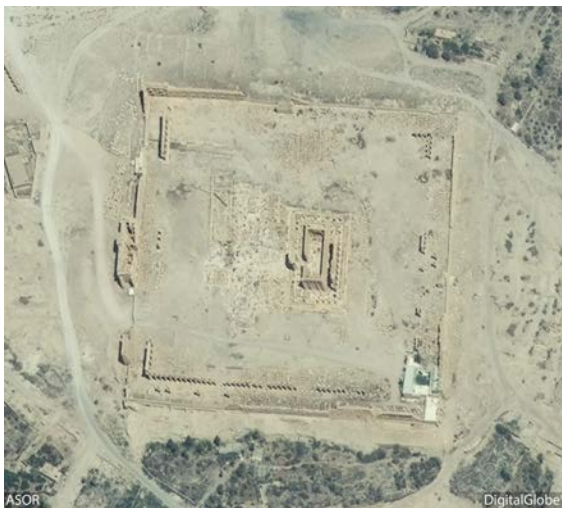
No visible damage (taken June 26, 2015)