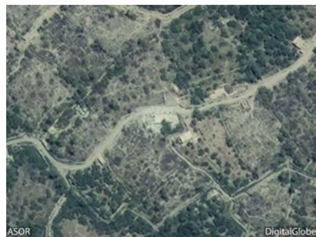
Visible damage (DigitalGlobe; June 26, 2015)