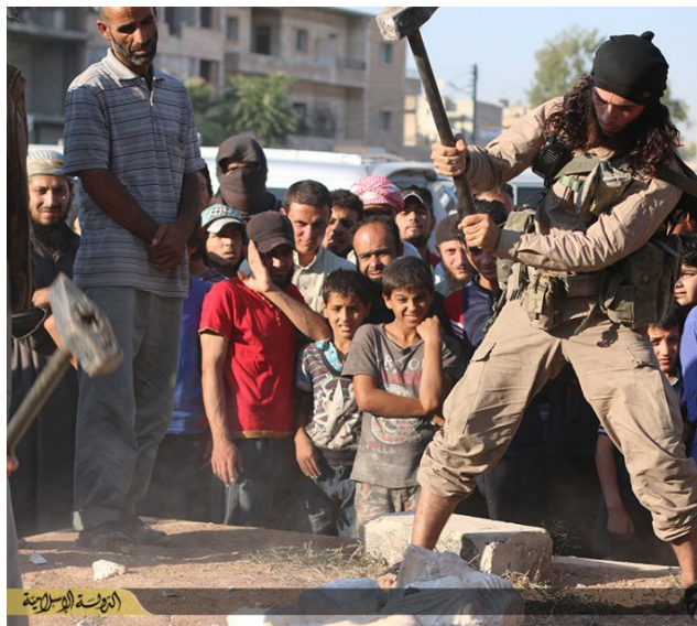
Figure 2: Destruction of Palmyrene statuary in Manbij, Aleppo governorate (ISIL social media; July 3, 2015)

The trafficking and sale of illicit cultural property, especially antiquities, have affected all of Syria and are a byproduct of the civil unrest stemming from the ongoing armed conflict. Museum staff in Palmyra have worked tirelessly to protect artifacts housed at the site, 10 but many of the architectural features around the ancient site have been looted, and stolen Palmyrene objects have appeared in other parts of the country and abroad. 11 On July 2, 2015 ISIL militants in the northern town of Manbij, located in Aleppo governorate, intercepted an individual or multiple individuals transporting Palmyrene funerary sculptures. These fragments were most likely removed from tombs at the archaeological site and/or possibly taken from the collections of the Tadmor Museum.