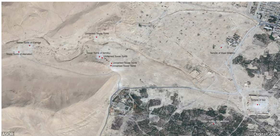
Figure 1: DigitalGlobe satellite imagery depicting multiple destroyed Islamic tombs and ancient architectural features in the Tadmor and Palmyra areas (September 2, 2015)

Since its capture by ISIL militants in May 2015, the region around the ancient city of Palmyra (modern Tadmor) has been in the midst of a humanitarian crisis, which has escalated dramatically in recent weeks. This report will provide a summary of the current situation in Palmyra and the effects of the conflict on its people and cultural heritage. Atrocities include attacks on civilians and mass abductions. Intentional damage to the cultural materials of the local populations is widespread, including the destruction of Islamic and Christian religious sites, as well as severe damage to the architectural remains within the UNESCO World Heritage Site of Palmyra. Confirmed damage at this archaeological site includes the destruction of the Baalshamin Temple, the Temple of Bel, and at least seven tower tombs within the Valley of the Tombs. For more detailed information on the heritage and history of the ancient city, please review the ASOR Cultural Heritage Initiative's Special Report on the Significance of Palmyra . 1