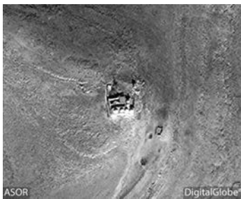
No visible damage (March 1, 2015)