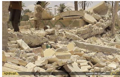
Figure 5: Sufi shrine and tomb of Shagaf/Nizar Abu Behaeddine (ISIL social media; June 22, 2015)