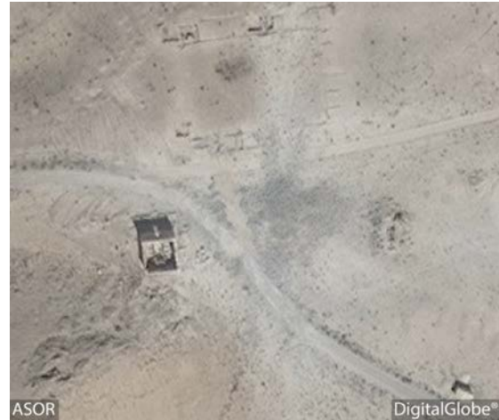
Visible damage (August 27, 2015)