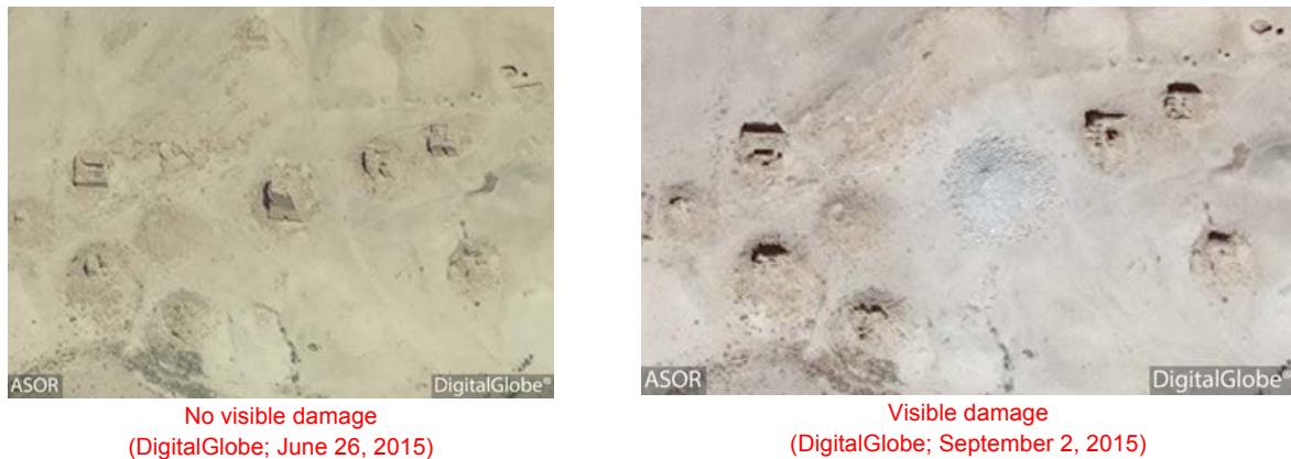
Figure 9: Satellite imagery of unnamed tower tombs in Tadmor