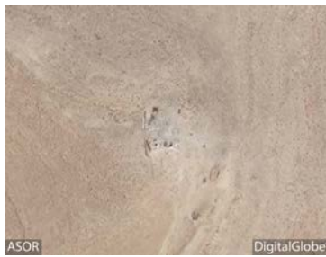
Visible damage (DigitalGlobe; May 28, 2015)