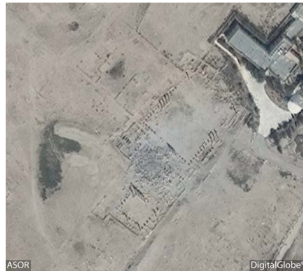
Visible damage (August 27, 2015)