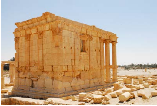
Figure 13: Baalshamin Temple (Michael Danti; 2010)