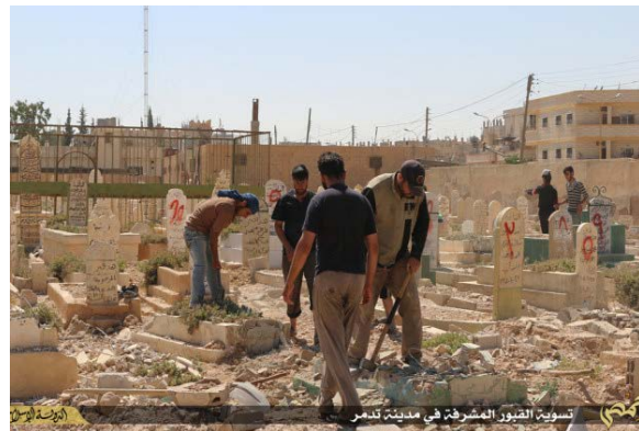
Figure 3: Graves in historic Palmyra being destroyed (ISIL social media; June 15, 2015)

On June 15, 2015 Twitter accounts associated with ISIL published images showing the destruction of a relatively modern Islamic cemetery. 20 The images currently circulating