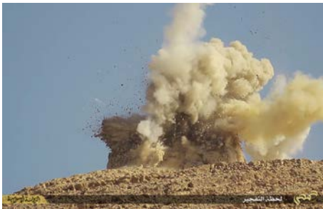
Figure 4: Shrine of Sheikh Mohammad b. 'Ali (ISIL social media; June 22, 2015)

On June 22, 2015 ISIL published photos depicting the destruction of Islamic shrines near the settlement of Tadmor. 21 The Shiite Shrine of Sheikh Mohammad ibn 'Ali was demolished between March 1, 2015 and May 22, 2015 based on observations of DigitalGlobe satellite imagery (Figures 4 and 6). ISIL destroyed the Sufi Tomb of Shagaf/Nizar Abu Behaeddine between June 15, 2015 and June 26, 2015 based on DigitalGlobe satellite imagery (Figures 5 and 7). 22