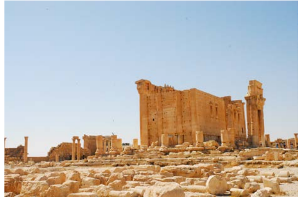
Figure 16: Temple of Bel

On August 30, 2015 it was reported that ISIL destroyed parts of the Temple of Bel with allegedly 30 tons of explosives. 29 DigitalGlobe satellite imagery confirms severe damage to the temple with only the front gateway of the inner cella left standing (Figure 17). Additionally, the temple colonnades, main entrance, and surrounding wall appear to be intact.