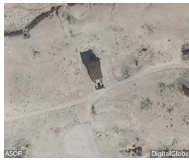
No visible damage (DigitalGlobe; August 27, 2015)