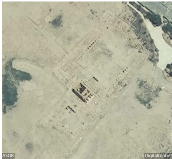
No visible damage (DigitalGlobe; June 26, 2015)

On August 23, 2015 reports surfaced concerning the destruction of the Baalshamin Temple. 26 Baalshamin was the Lord of the Heavens in the pre-Islamic Semitic pantheon. According to Ross Burns, the earliest architectural remains date to 17 CE, though the majority of the structure dates to the early 2nd century CE. The Egyptian motifs that characterize the style of the small temple make it unique in Roman Syria. 27 Following the destruction, photographs released by ISIL depicted the inner and outer walls of the temple lined with bottles and barrels of explosives, which were subsequently detonated. 28 DigitalGlobe satellite imagery taken on August 27, 2015 acquired by ASOR CHI has confirmed this destruction (Figure 15).