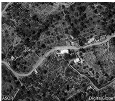
No visible damage (DigitalGlobe; June 16, 2015)