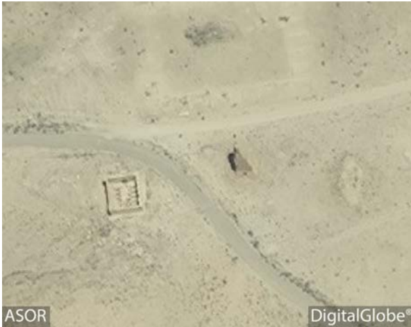
No visible damage (June 26, 2015)