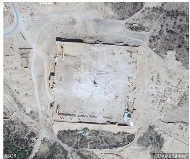
Visible damage (September 2, 2015)